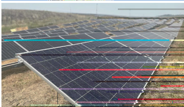
Figure 1: Project Picture